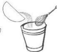
Step 3: Add powder to bucket and mix thoroughly