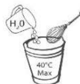
Step 4: Top up to required volume and mix thoroughly

Mixing Rate: 125 grams of powder mixed with water to make 1 litre of mixed milk.